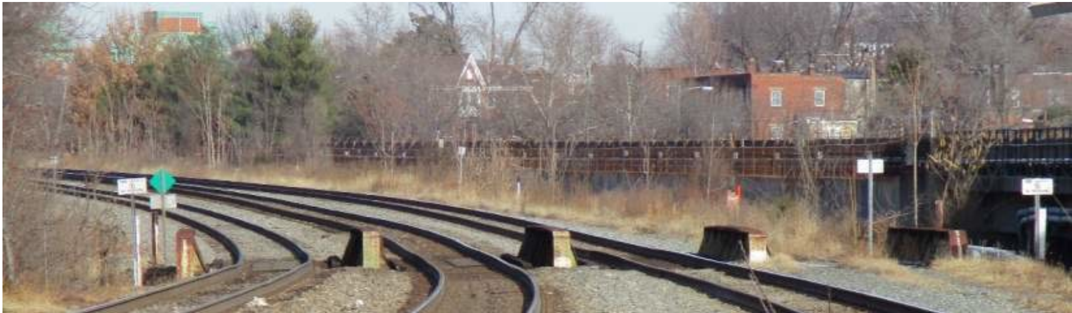
Commonwealth Avenue Bridge Looking North