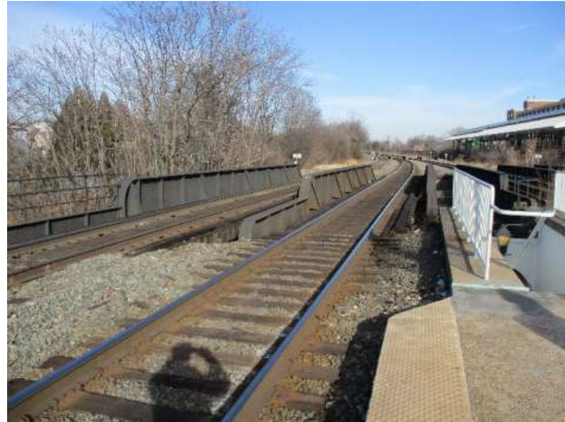
King Street Bridge Looking North from VRE Station